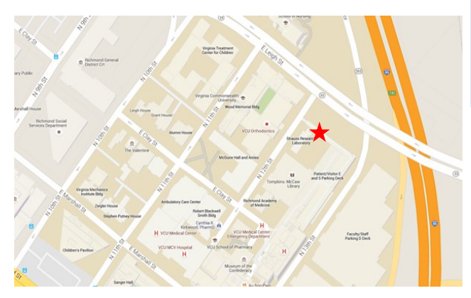
From Gateway Building Valet to Apheresis Unit Take visitor elevators to 4th floor. Follow hall to the right into Main Hospital Building. Make right at Apheresis sign, and continue through double doors. Have a seat in waiting area, and nurses will be with you shortly.

VCU Medical Center's Patient and Visitor Parking Deck, located near the corner of 12th and Leigh streets, is open 24 hours a day, 7 days a week. Patient and Visitor Parking will be validated in the Apheresis Unit and rates will be reduced $2.00 per visit.